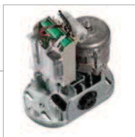
Motor ground fixation

Reliable and hard-wearing for sliding gates